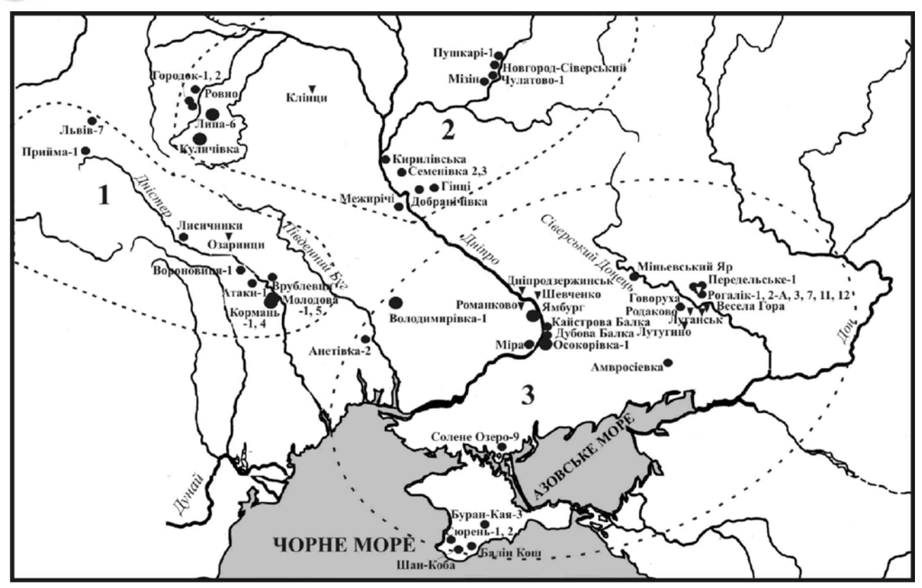
Fig. 3. Map of stylistic provinces of Late Paleolithic art in Ukraine. 1- Western Stylistic Province, 2- Northern Stylistic Province, 3- South-Eastern Stylistic Province.