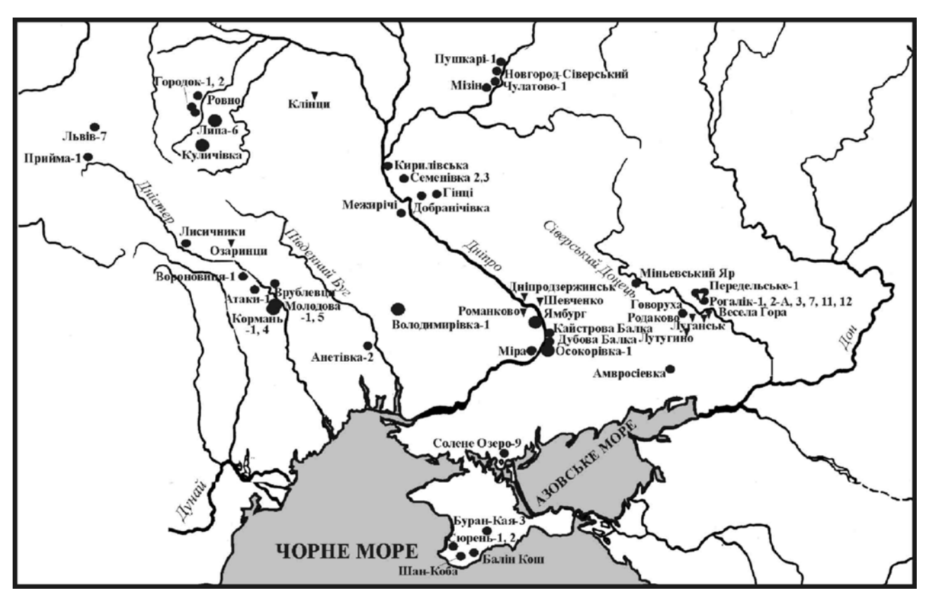
Fig. 1. Map of the Late Paleolithic sites with the subjects of art in Ukraine.